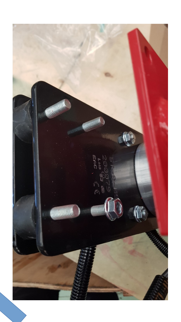
Remove nuts (x 4)